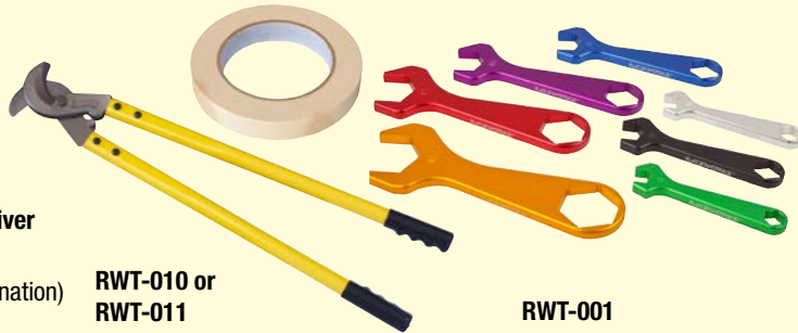
RWT-010 or RWT-011