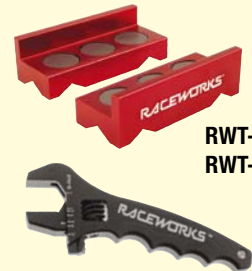
RWT-002 or RWT-003