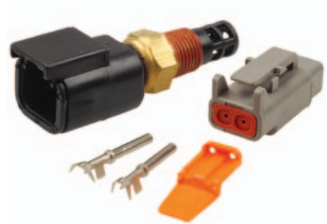
Part No. ATS-026