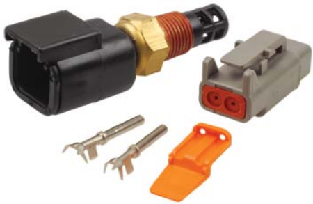
Part No. ATS-026